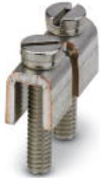
Fixed bridge, pitch: 12 mm, number of positions: 2, color: silver

Please be informed that the data shown in this PDF Document is generated from our Online Catalog. Please find the complete data in the user's documentation. Our General Terms of Use for Downloads are valid ( http://phoenixcontact.com/download )