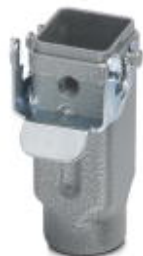
HEAVYCON D7 coupling housing, with single locking latch, height: 60.5 mm, with 1 x M20 gland, zinc die-cast

Please be informed that the data shown in this PDF Document is generated from our Online Catalog. Please find the complete data in the user's documentation. Our General Terms of Use for Downloads are valid ( http://phoenixcontact.com/download )