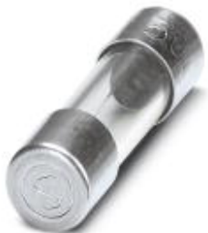
Security, idle, 2.5 ampere

Please be informed that the data shown in this PDF Document is generated from our Online Catalog. Please find the complete data in the user's documentation. Our General Terms of Use for Downloads are valid ( http://phoenixcontact.com/download )