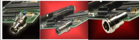
Patented V-Bite®, Snaps Into PCB, Surface Mount Center Contact