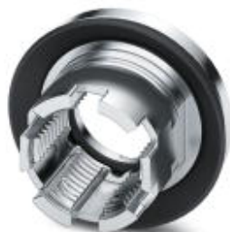
M12 threaded sleeve with tolerance-compensating function, for straight, SMD-solderable M12 socket contact inserts. Suitable for 0.9 mm ... 1.6 mm thick front plates.

Please be informed that the data shown in this PDF Document is generated from our Online Catalog. Please find the complete data in the user's documentation. Our General Terms of Use for Downloads are valid ( http://phoenixcontact.com/download )