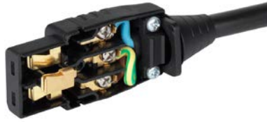
Example with assembled cable