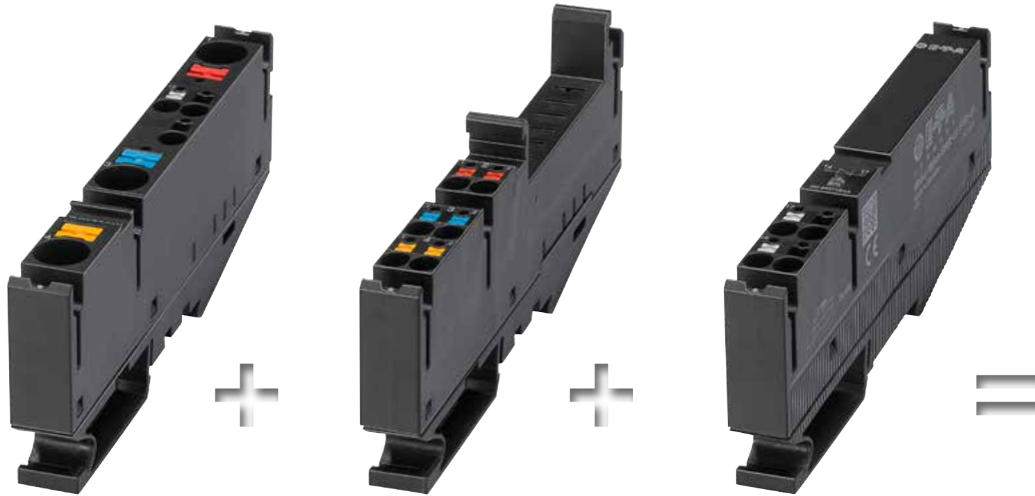
18plus-EM supply module terminal 1 (LINE +), terminal 3 (0 V), terminal 4 (FE), terminal 13 (aux. contact input)

Supply terminals PLUS connection terminals PLUS signal terminals PLUS integral wire harness PLUS flexible circuit breaker equipment ... More than 18 positive qualities mutually enhance their effects!