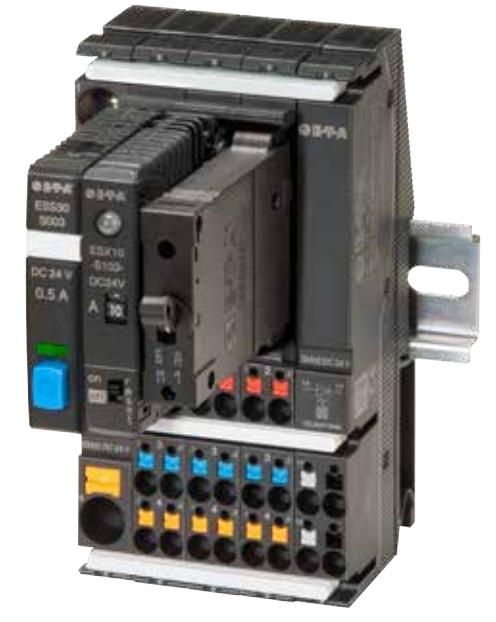
Power distribution system Module 18plus compact system optionally fitted with - electronic circuit breaker ESS30-S, - electronic circuit protector ESX10 - thermal-magnetic circuit breaker 2210-S