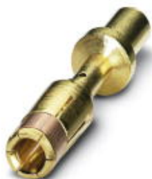
Crimp contact, turned, Single contact, contact diameter: 3.6 mm, crimp range: 2.5 mm 2 ... 4 mm 2

Please be informed that the data shown in this PDF Document is generated from our Online Catalog. Please find the complete data in the user's documentation. Our General Terms of Use for Downloads are valid ( http://phoenixcontact.com/download )