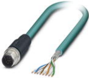
Assembled Ethernet cable, shielded, 4-pair, AWG 26 stranded (7-wire), RAL 5021 (sea blue), M12 plug to free cable end, line, length 2 m

Please be informed that the data shown in this PDF Document is generated from our Online Catalog. Please find the complete data in the user's documentation. Our General Terms of Use for Downloads are valid ( http://download.phoenixcontact.com )