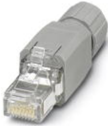
RJ45 connector, IP20, CAT5e, 4-pos., PROFINET with QUICKON fast connection technology, for 1-wire and 7-wire conductors AWG 22, for cable diameter 4.5 mm ... 8.0 mm, color: gray

Please be informed that the data shown in this PDF Document is generated from our Online Catalog. Please find the complete data in the user's documentation. Our General Terms of Use for Downloads are valid ( http://download.phoenixcontact.com )