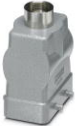
HEAVYCON B10 sleeve housing, for double locking latch, height: 72 mm, with 1 x Pg21 gland, straight cable outlet

Please be informed that the data shown in this PDF Document is generated from our Online Catalog. Please find the complete data in the user's documentation. Our General Terms of Use for Downloads are valid ( http://download.phoenixcontact.com )