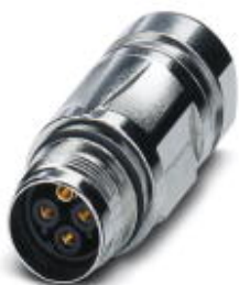
Coupler connector, straight, SPEEDCON locking, M17, Number of positions: 5+3+PE, Type of contact: Socket, Crimp connection, shielded: yes, Cable diameter: 5 mm...8 mm

Please be informed that the data shown in this PDF Document is generated from our Online Catalog. Please find the complete data in the user's documentation. Our General Terms of Use for Downloads are valid ( http://phoenixcontact.com/download )