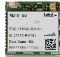
Actual Size (25.4mm x 25.4mm)

Support works onsite with Laird engineering to speed your design to market.