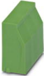
Filler plugs, for unoccupied terminal points

Please be informed that the data shown in this PDF Document is generated from our Online Catalog. Please find the complete data in the user's documentation. Our General Terms of Use for Downloads are valid ( http://phoenixcontact.com/download )